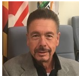
Click to view Small Business Saturday video